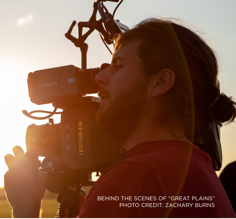
BEHIND THE SCENES OF "GREAT PLAINS"