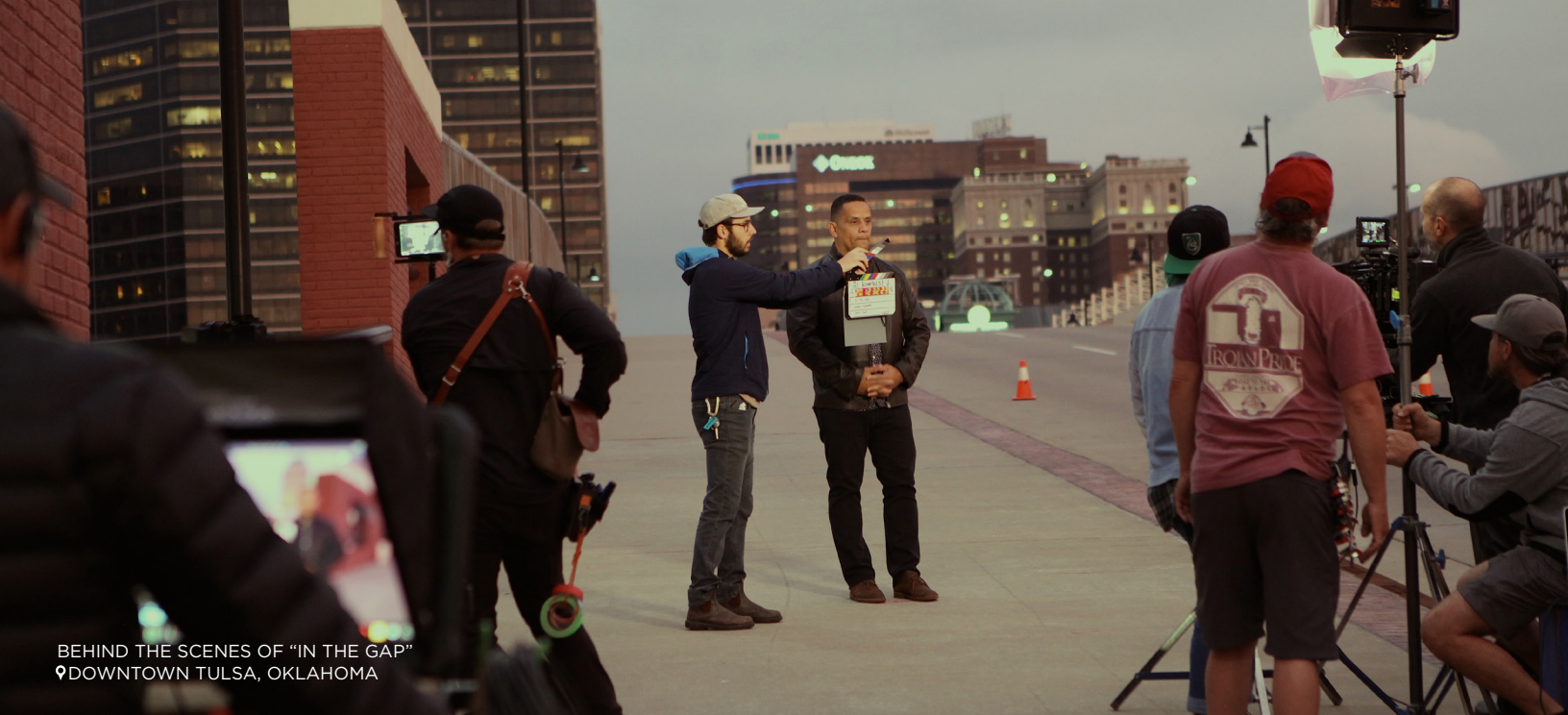
BEHIND THE SCENES OF "IN THE GAP" DOWNTOWN TULSA, OKLAHOMA

No one knows your area better than you do, and there will be times we may turn to your community liaison to provide additional information on either locations we don't have in our database or those sites of which we may not be aware. In cases like these, we will distribute correspondence to our designated Film Friendly Community Liaisons with detailed information related to the locations query and/or package we are assembling.