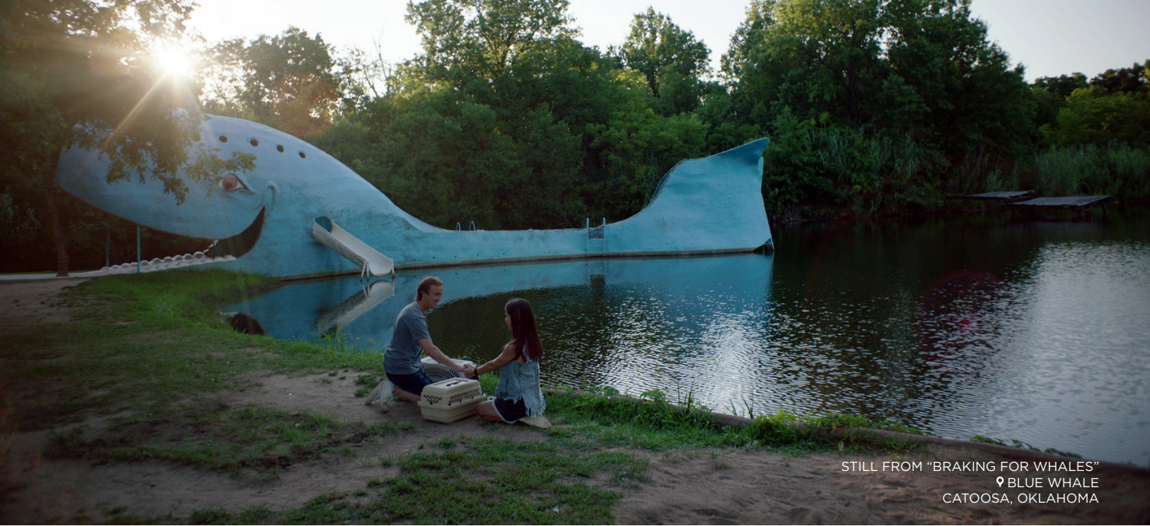
STILL FROM "BRAKING FOR WHALES" 📍 BLUE WHALE CATOOSA, OKLAHOMA